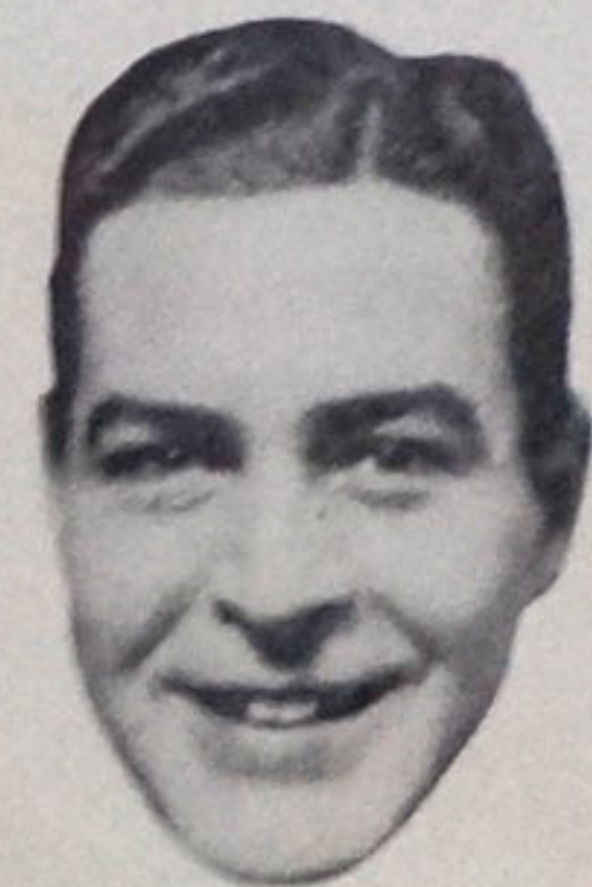
Cool, Calm Confidence.

good. Let us not regard it as something clever; cunning is not cleverness and hence cannot abide in the heart. We arm the path of knowledge, but let us not in silence neglect the creative principle of benevolence.