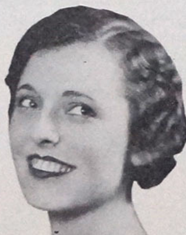
"Joy in Living."

An Inferiority Complex is a disturbance in the Subconscious Mind which manifests itself in a self-consciousness and lack of confidence—in nervous mannerisms—worry and timidity—lack of enterprise—in weakness of will and indecision—in forgetfulness and lack of concentration. Its origin lies in experiences and influences during your personality-development, which may be entirely forgotten, but their effects remain in the form of a "disturbance centre" in Subconsciousness, which sends out powerful negative impulses.