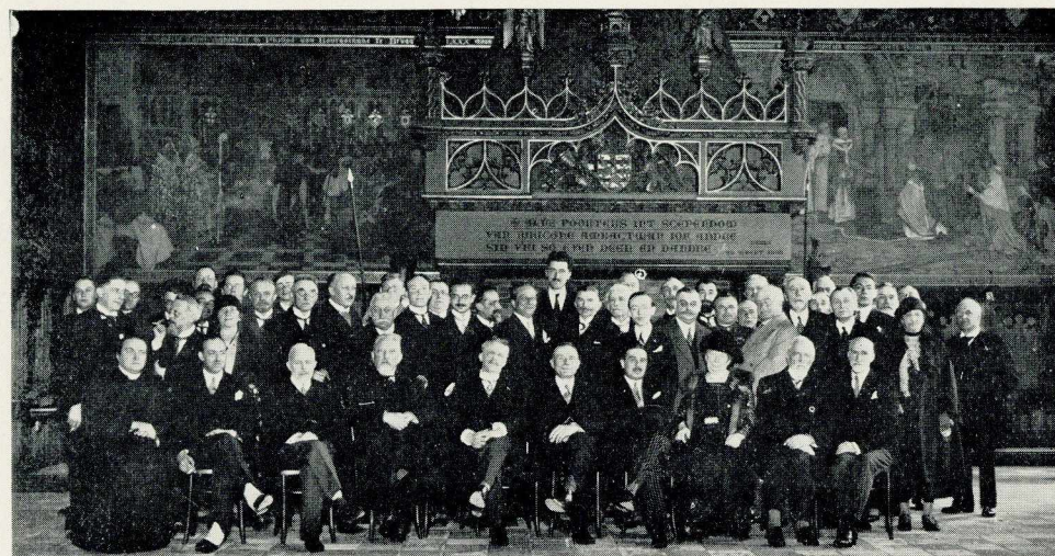
DELEGATES TO THE INTERNATIONAL CONFERENCE AT BRUGES AT THE RECEPTION GIVEN IN THE HISTORIC TOWN HALL.

"To unite all nations under the Roerich Banner of Peace in a pact to protect all monuments of scientific and artistic worth and interest would be a